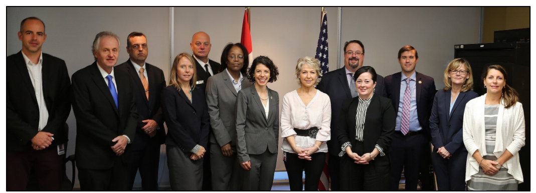
ENGAGEMENT. The DOJ delegation poses for a photo with CSC staff.